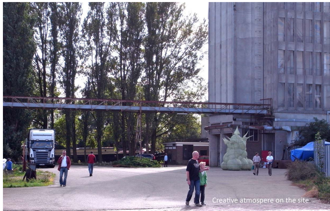
Creative atmosphere on the site