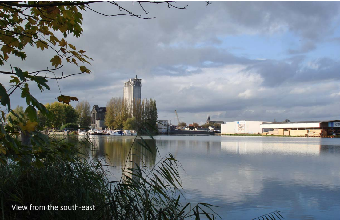
View from the south-east