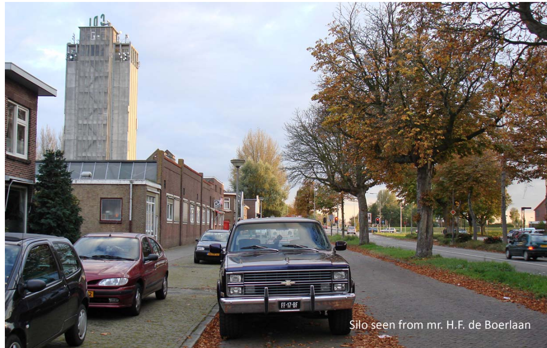
Silo seen from mr. H.F. de Boerlaan