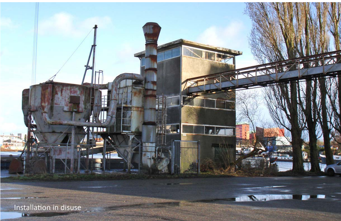
Installation in disuse